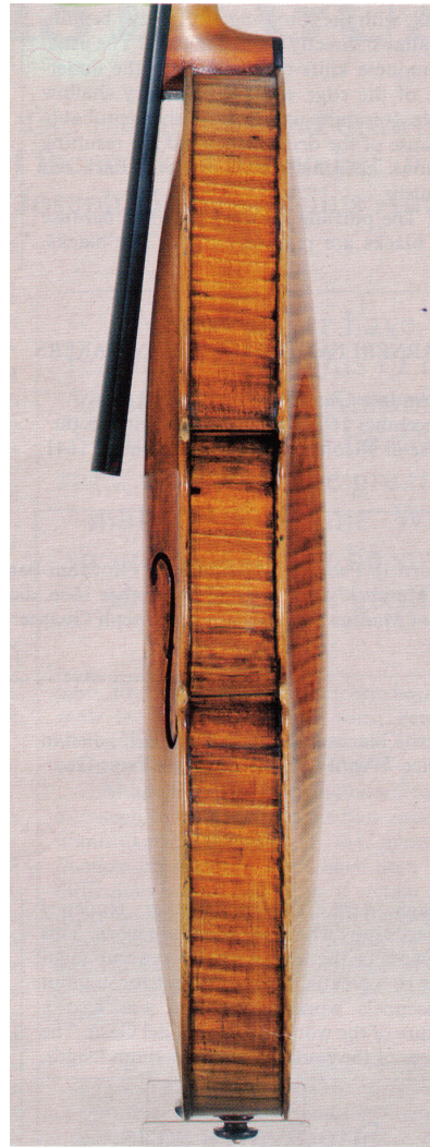
Side of the violin by Giuseppe Giovanni Battista Guarneri.

are almost no tool marks on the belly and the pure state of its preservation is accompanied by a rich covering of original varnish.