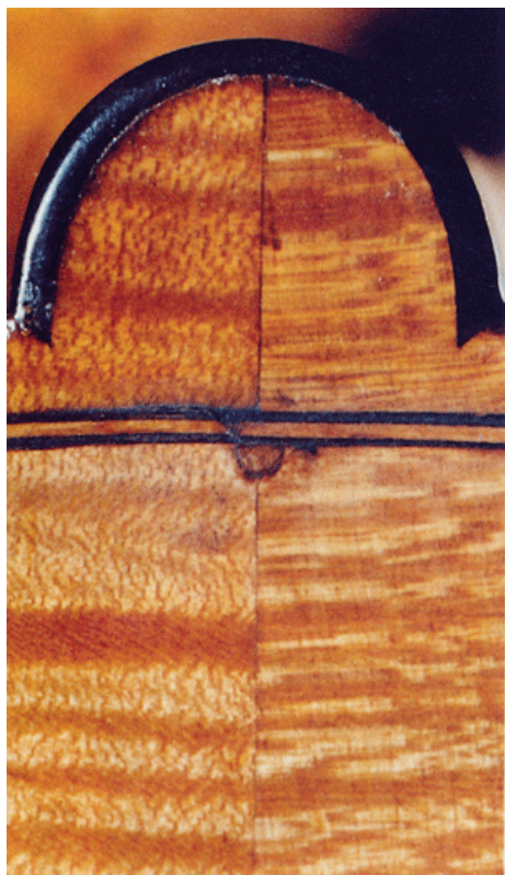
Above: the purfling comes together at the top and bottom with diagonally cut scarf joints. Right: the head is in pristine condition

almost grey On either side of the central whites, one black strip is always slightly thicker than the other, indicating that the purfling was all cut from a wider sandwich. That the strips were glued together beforehand is demonstrated by the fact that in the lower bass corner of the belly all three strips have lifted out of the channel together. In some places the groove for the purfling is unevenly cut and a little filler is evident in the back channel, especially in the corners. In two places on the lower bouts of the back the purfling cutter has slipped out of the channel, a rare occurrence for Stradivari even at this late stage. In spite of these details there is every sign (especially with the long purfling mitres) that Stradivari was seeking to maintain a high standard in appearance if not in execution. On the back the purfling comes together at the top and bottom with diagonally cut scarf joints. These correspond with the centre joint of the back. Also at this point the purfling cuts through the two locating pins